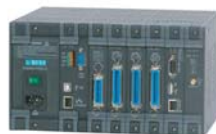
6S Chassis 4-16 Channel Models