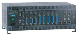
12S Chassis 16-32 Channel Models